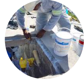
Coatings & anti-corrosion coatings