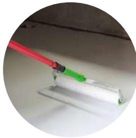
Flooring & coatings