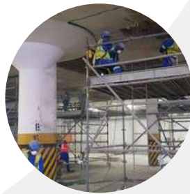
Concrete structural repair